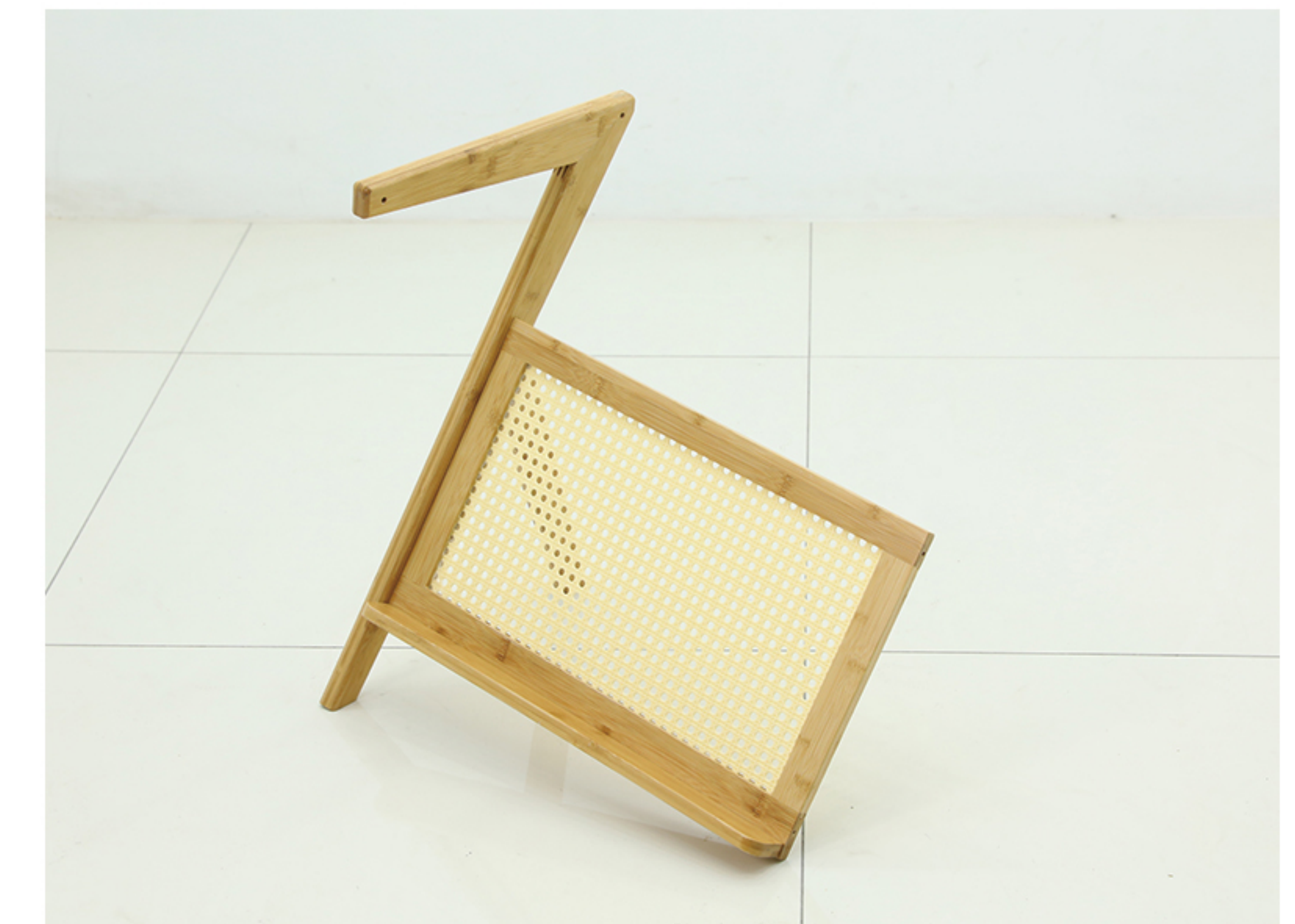
2. Attach one side support to the board with long screws