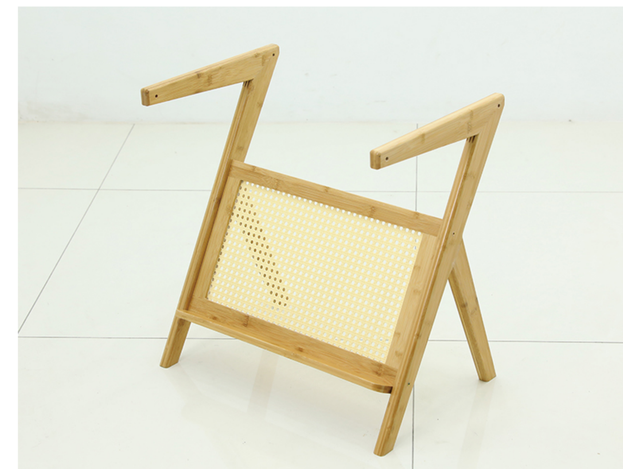
3. Attach the other side support to the board with long screws