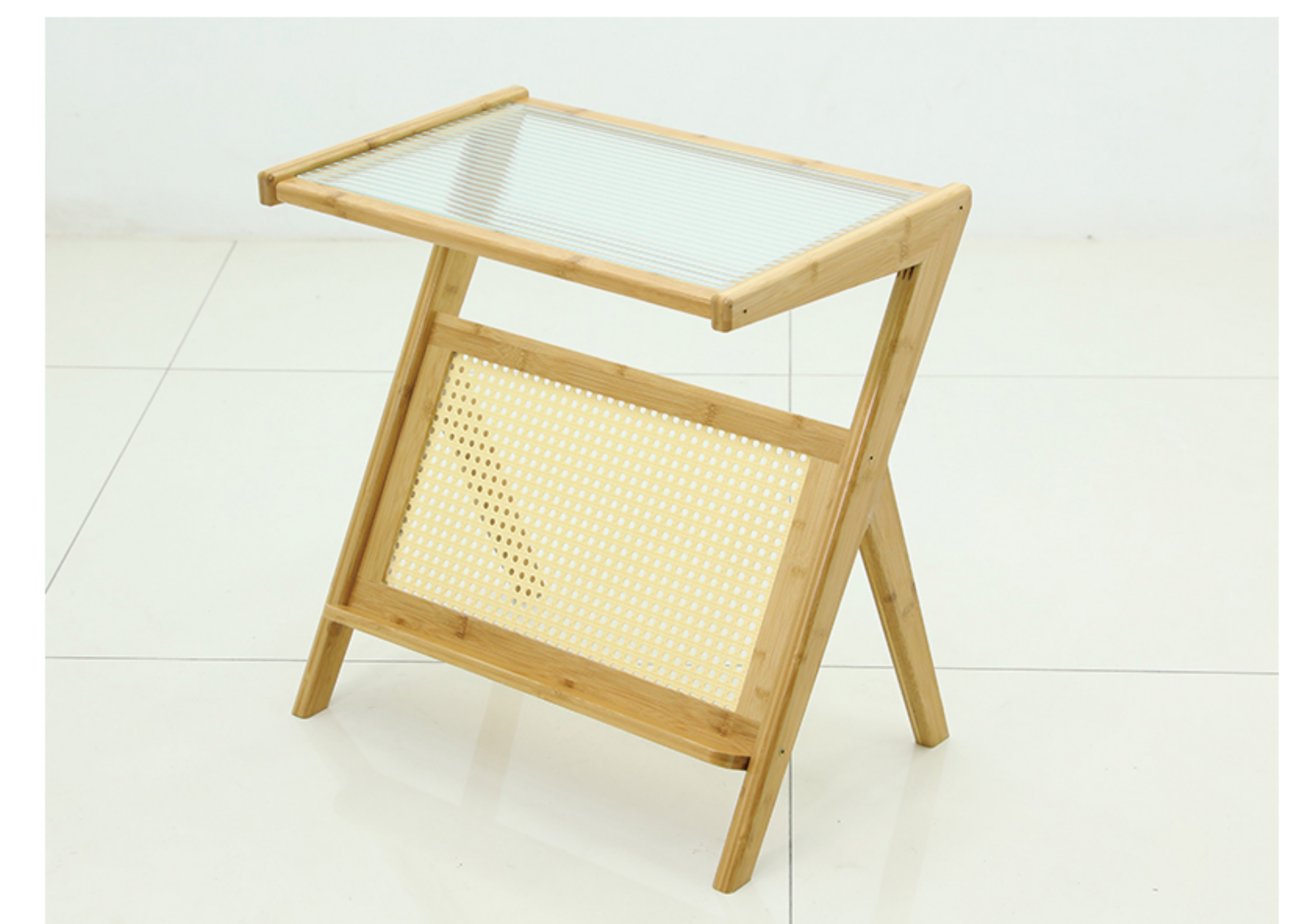
6. Place the glass top on the frame