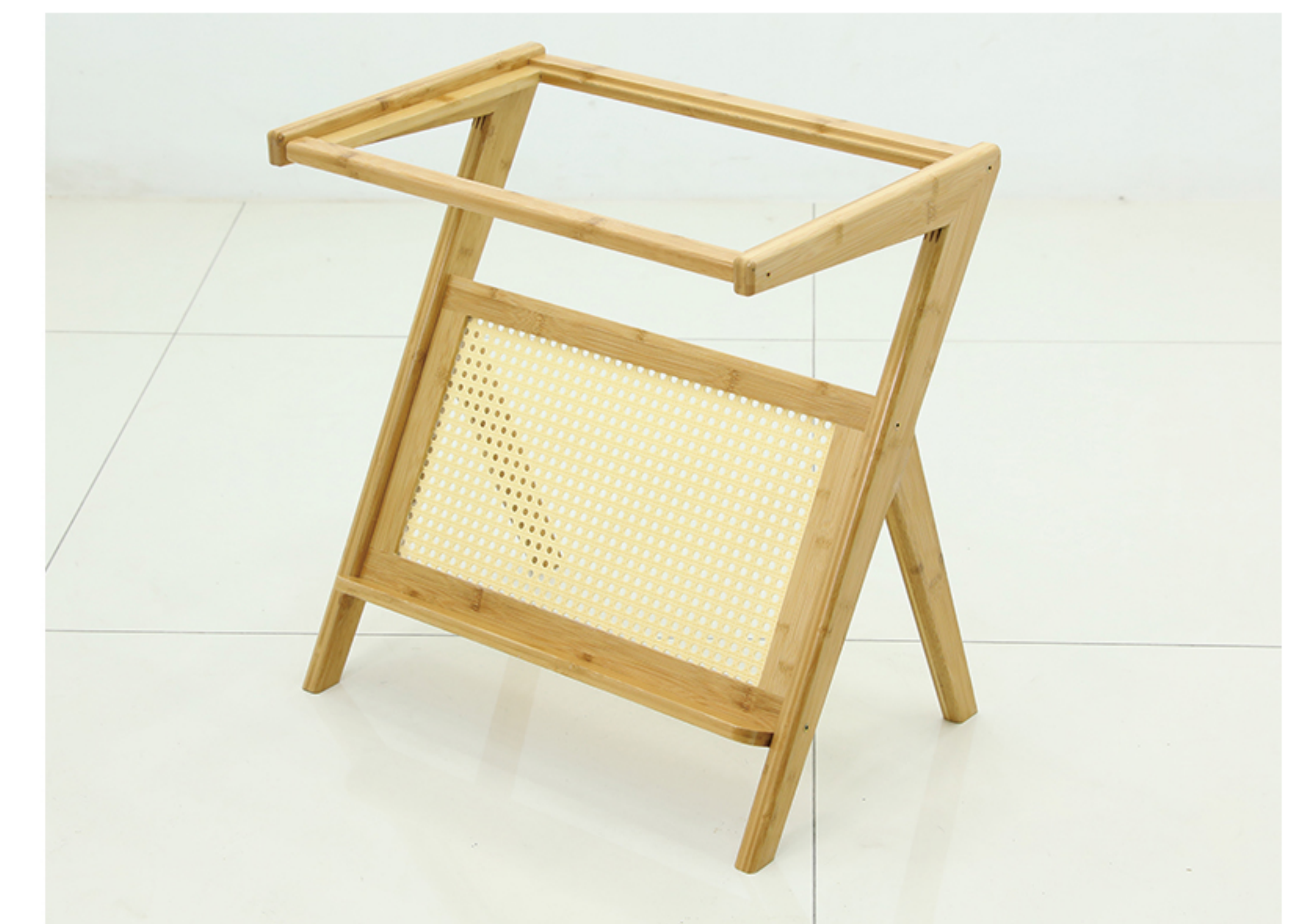
4. Fix the frame on top of the side supports with the grooves upward