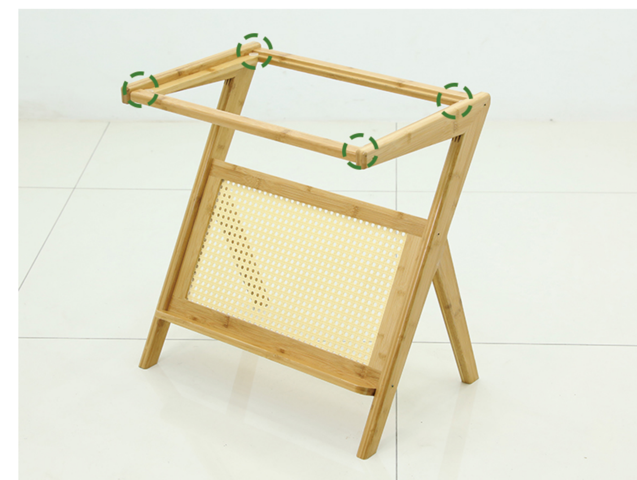
5. Stick the spacer pieces on the 4 corners of the frame