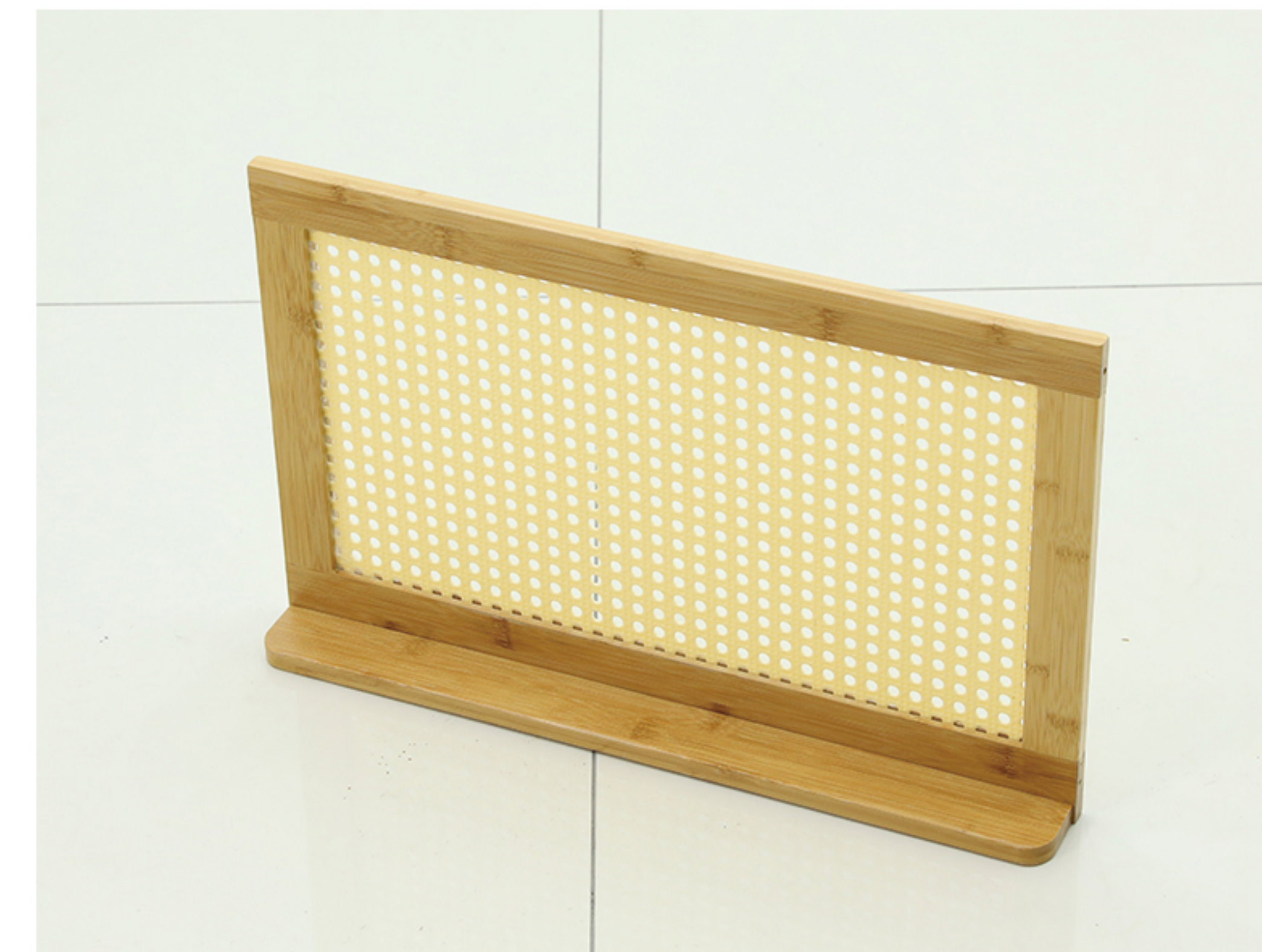
1. Connect the bar and the board with short screws